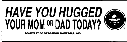
3' x 9'

In addition to these items pictured at left, ALL-AMERICAN T-shirt Co., Inc. has a wide variety of items we can custom print for your Snowball Event or School.