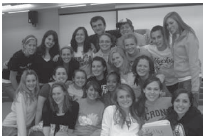
Members of Naperville Operation Snowball chapter.

began to discover the person who had been living inside all along. Snowball is a teen-led retreat that focuses on promoting a drug-free and accepting lifestyle among teens. Over the course of the weekend, I found myself surrounded by an environment that I had