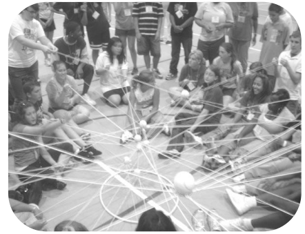
Participants work together on a group challenge activity

For Directions or Lake Williamson Information: www.lakewilliamson.com