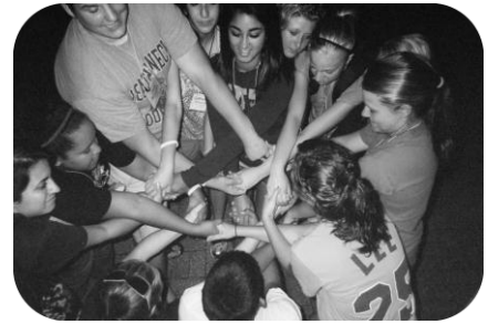
Participants work together on a group challenge activity